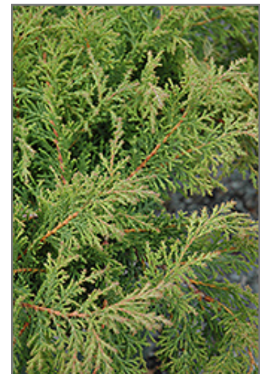
Fuzzball Siberian Carpet Cypress foliage