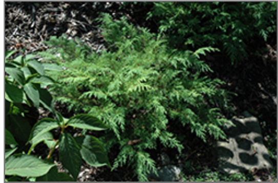
Fuzzball Siberian Carpet Cypress

This shrub does best in partial shade to shade. It does best in average to evenly moist conditions, but will not tolerate standing water. It is not particular as to soil type or pH. It is quite intolerant of urban pollution, therefore inner city or urban streetside plantings are best avoided, and will benefit from being planted in a relatively sheltered location. Consider applying a thick mulch around the root zone in winter to protect it in exposed locations or colder microclimates. This is a selected variety of a species not originally from North America.