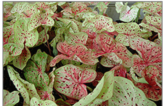
Miss Muffet Caladium foliage