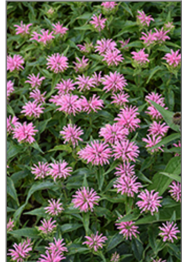
Pardon My Pink Beebalm flowers