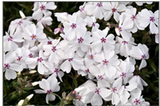
Amazing Grace Moss Phlox flowers