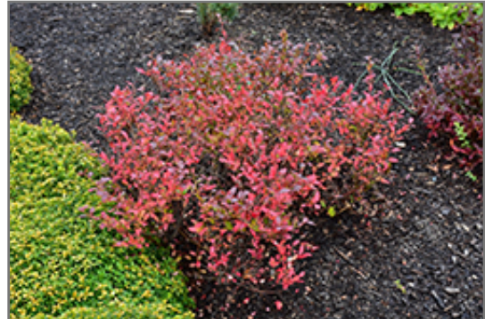
Lowbush Blueberry in fall

This shrub is typically grown in a designated area of the yard because of its mature size and spread. It performs well in both full sun and full shade. It does best in average to evenly moist conditions, but will not tolerate standing water. It is very fussy about its soil conditions and must have sandy, acidic soils to ensure success, and is subject to chlorosis (yellowing) of the foliage in alkaline soils. It is quite intolerant of urban pollution, therefore inner city or urban streetside plantings are best avoided, and will benefit from being planted in a relatively sheltered location. Consider applying a thick mulch around the root zone in winter to protect it in exposed locations or colder microclimates. This species is native to parts of North America.