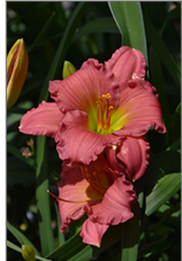
Passionate Returns Daylily flowers