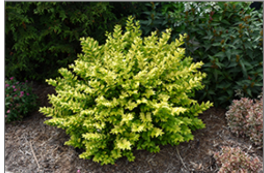
Golden Ticket Privet