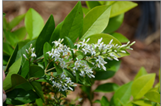
Golden Ticket Privet flowers

This shrub should only be grown in full sunlight. It is very adaptable to both dry and moist locations, and should do just fine under average home landscape conditions. It is not particular as to soil type or pH, and is able to handle environmental salt. It is highly tolerant of urban pollution and will even thrive in inner city environments. This particular variety is an interspecific hybrid.