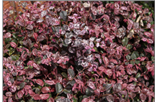
Jazz Hands Variegated Chinese Fringe-flower foliage

This is a relatively low maintenance shrub, and should only be pruned after flowering to avoid removing any of the current season's flowers. It has no significant negative characteristics.