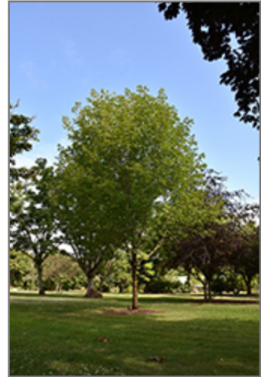
Flashfire Sugar Maple

This tree should only be grown in full sunlight. It prefers to grow in average to moist conditions, and shouldn't be allowed to dry out. It is not particular as to soil pH, but grows best in rich soils. It is somewhat tolerant of urban pollution. This is a selection of a native North American species.