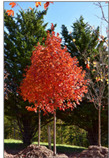
Flashfire Sugar Maple in fall