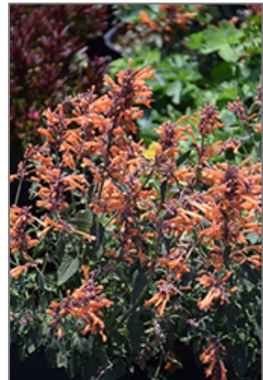
Kudos Mandarin Hyssop flowers