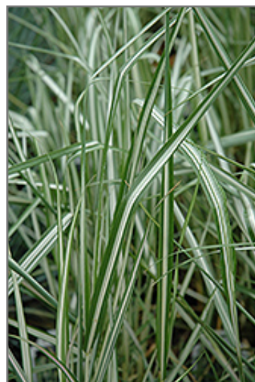
Avalanche Reed Grass foliage