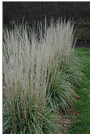
Avalanche Reed Grass in fall

Avalanche Reed Grass is recommended for the following landscape applications;