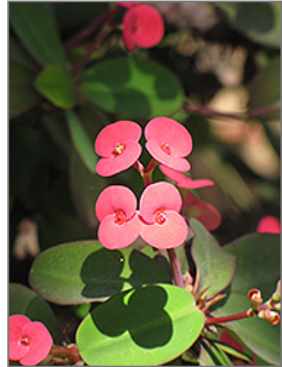
Crown Of Thorns flowers

This is a multi-stemmed evergreen houseplant with an upright spreading habit of growth. This plant may benefit from an occasional pruning to look its best.