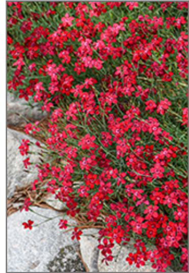
Flashing Light Maiden Pinks flowers