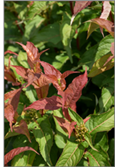
Kodiak Orange Diervilla foliage

Kodiak Orange Diervilla is recommended for the following landscape applications;