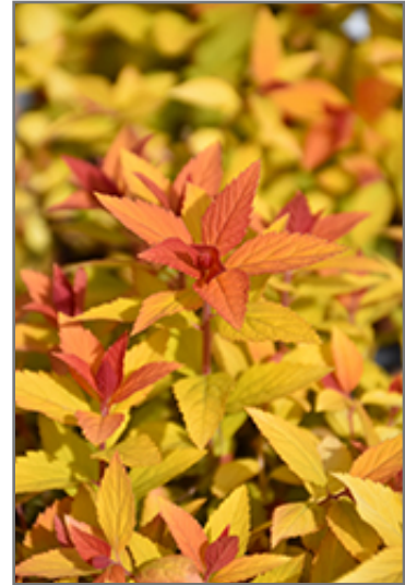
Double Play Candy Corn Spirea foliage

This shrub will require occasional maintenance and upkeep, and is best pruned in late winter once the threat of extreme cold has passed. It is a good choice for attracting butterflies to your yard, but is not particularly attractive to deer who tend to leave it alone in favor of tastier treats. It has no significant negative characteristics.