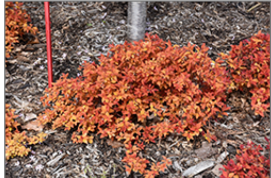
Double Play Candy Corn Spirea

This shrub should only be grown in full sunlight. It prefers to grow in average to moist conditions, and shouldn't be allowed to dry out. It is not particular as to soil type or pH. It is highly tolerant of urban pollution and will even thrive in inner city environments. This is a selected variety of a species not originally from North America.