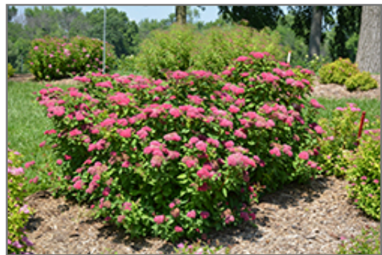
Double Play Red Spirea in bloom