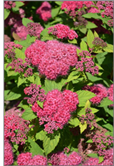
Double Play Red Spirea flowers

This shrub will require occasional maintenance and upkeep, and is best pruned in late winter once the threat of extreme cold has passed. It is a good choice for attracting butterflies to your yard, but is not particularly attractive to deer who tend to leave it alone in favor of tastier treats. It has no significant negative characteristics.