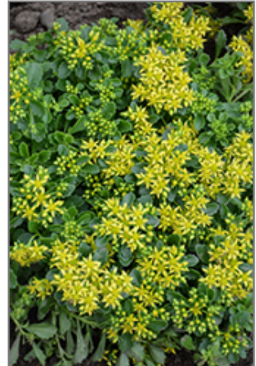
Little Miss Sunshine Stonecrop flowers

Little Miss Sunshine Stonecrop is recommended for the following landscape applications;