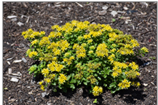
Little Miss Sunshine Stonecrop in bloom