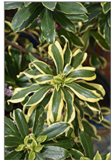
Moonlight Parfait Winter Daphne foliage