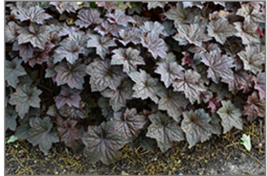
Palace Purple Coral Bells

Palace Purple Coral Bells is a fine choice for the garden, but it is also a good selection for planting in outdoor pots and containers. With its upright habit of growth, it is best suited for use as a 'thriller' in the 'spiller-thriller-filler' container combination; plant it near the center of the pot, surrounded by smaller plants and those that spill over the edges. Note that when growing plants in outdoor containers and baskets, they may require more frequent waterings than they would in the yard or garden.