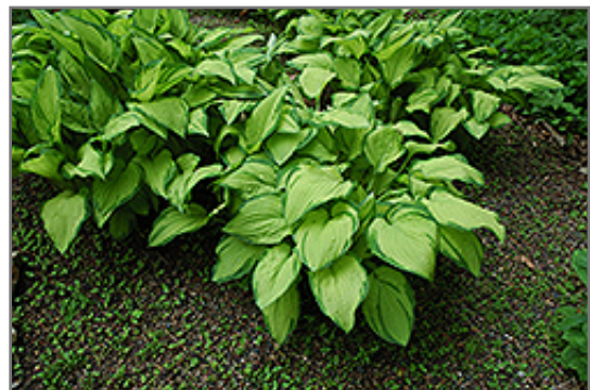
Gold Standard Hosta