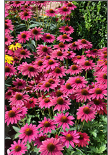
Sombrero Tres Amigos Coneflower flowers

Sombrero Tres Amigos Coneflower is a fine choice for the garden, but it is also a good selection for planting in outdoor pots and containers. With its upright habit of growth, it is best suited for use as a 'thriller' in the 'spiller-thriller-filler' container combination; plant it near the center of the pot, surrounded by smaller plants and those that spill over the edges. Note that when growing plants in outdoor containers and baskets, they may require more frequent waterings than they would in the yard or garden.