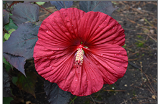
Summerific Holy Grail Hibiscus flowers

Summerific Holy Grail Hibiscus is an herbaceous perennial with an upright spreading habit of growth. Its relatively coarse texture can be used to stand it apart from other garden plants with finer foliage.