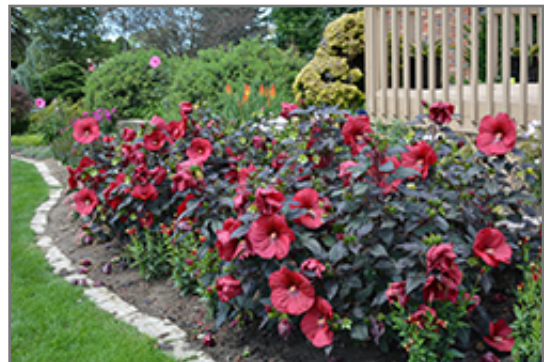
Summerific Holy Grail Hibiscus in bloom