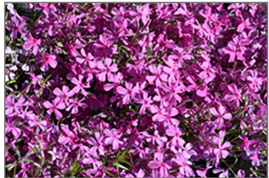
Spring Dark Pink Moss Phlox flowers