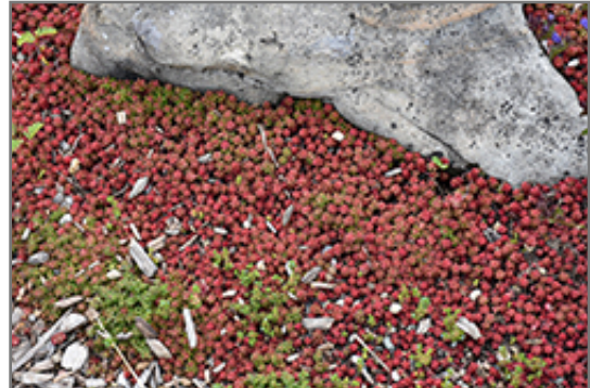
Coral Carpet Stonecrop

Coral Carpet Stonecrop is a dense herbaceous evergreen perennial with a ground-hugging habit of growth. Its medium texture blends into the garden, but can always be balanced by a couple of finer or coarser plants for an effective composition.