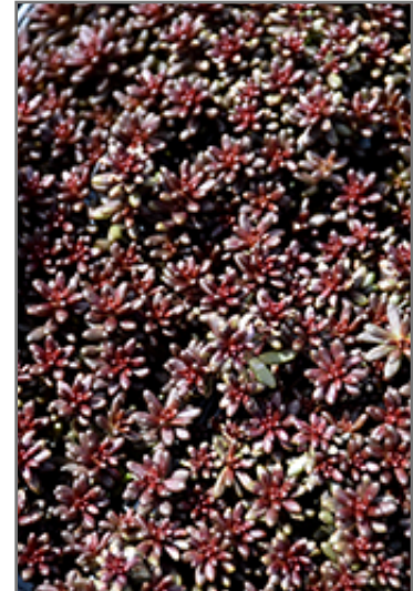
Coral Carpet Stonecrop

Coral Carpet Stonecrop is a fine choice for the garden, but it is also a good selection for planting in outdoor pots and containers. Because of its spreading habit of growth, it is ideally suited for use as a 'spiller' in the 'spiller-thriller-filler' container combination; plant it near the edges where it can spill gracefully over the pot. Note that when growing plants in outdoor containers and baskets, they may require more frequent waterings than they would in the yard or garden.