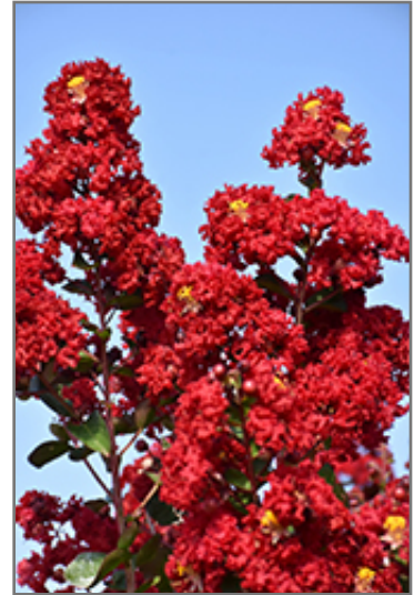
Double Dynamite Crapemyrtle flowers

This shrub does best in full sun to partial shade. It prefers to grow in average to moist conditions, and shouldn't be allowed to dry out. It is very fussy about its soil conditions and must have rich, acidic soils to ensure success, and is subject to chlorosis (yellowing) of the foliage in alkaline soils. It is highly tolerant of urban pollution and will even thrive in inner city environments. This is a selected variety of a species not originally from North America.