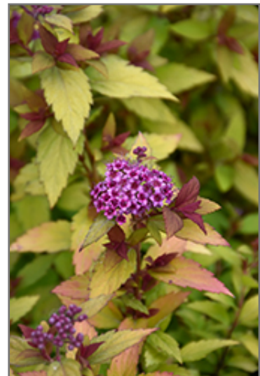
Poprocks Rainbow Fizz Spirea flowers