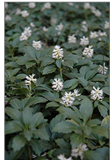
Japanese Spurge flowers