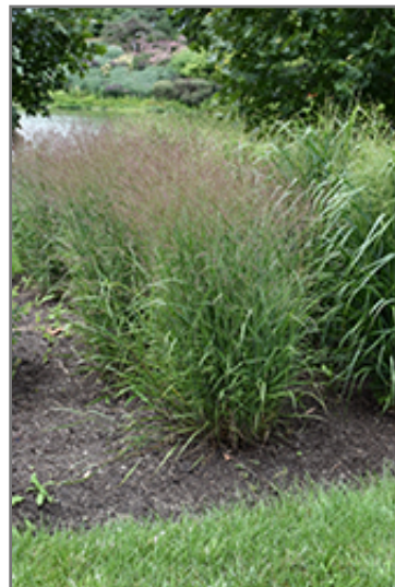
Purple Tears Switch Grass in bloom