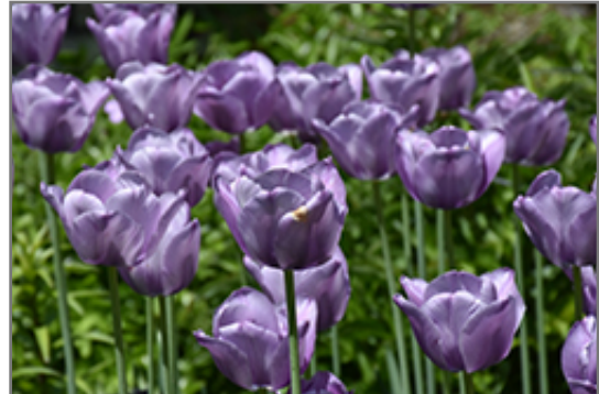
Bleu Aimable Tulip flowers

Bleu Aimable Tulip is recommended for the following landscape applications;