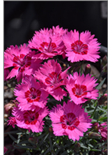
Paint The Town Fancy Pinks flowers

Paint The Town Fancy Pinks is a fine choice for the garden, but it is also a good selection for planting in outdoor pots and containers. It is often used as a 'filler' in the 'spiller-thriller-filler' container combination, providing a mass of flowers and foliage against which the thriller plants stand out. Note that when growing plants in outdoor containers and baskets, they may require more frequent waterings than they would in the yard or garden.