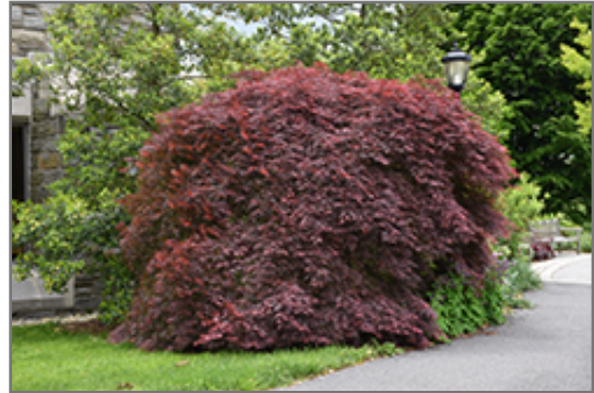
Tamukeyama Japanese Maple

Tamukeyama Japanese Maple will grow to be about 7 feet tall at maturity, with a spread of 10 feet. It tends to be a little leggy, with a typical clearance of 3 feet from the ground, and is suitable for planting under power lines. It grows at a slow rate, and under ideal conditions can be expected to live for 80 years or more.