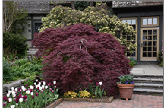
Tamukeyama Japanese Maple

This is a relatively low maintenance tree, and should only be pruned in summer after the leaves have fully developed, as it may 'bleed' sap if pruned in late winter or early spring. It has no significant negative characteristics.