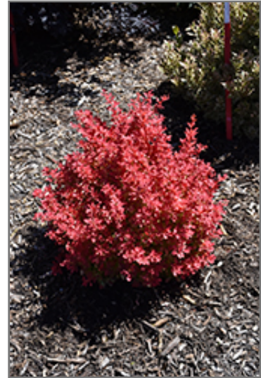
Sunjoy Neo Japanese Barberry

Sunjoy Neo Japanese Barberry makes a fine choice for the outdoor landscape, but it is also well-suited for use in outdoor pots and containers. It can be used either as 'filler' or as a 'thriller' in the 'spiller-thriller-filler' container combination, depending on the height and form of the other plants used in the container planting. It is even sizeable enough that it can be grown alone in a suitable container. Note that when grown in a container, it may not perform exactly as indicated on the tag - this is to be expected. Also note that when growing plants in outdoor containers and baskets, they may require more frequent waterings than they would in the yard or garden.