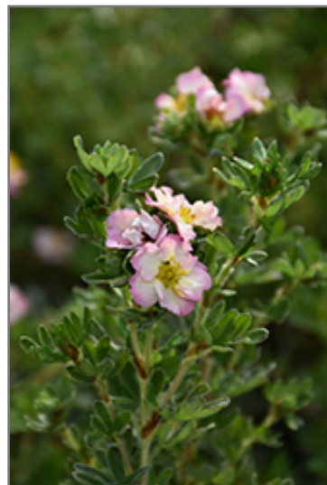
Happy Face Hearts Potentilla flowers