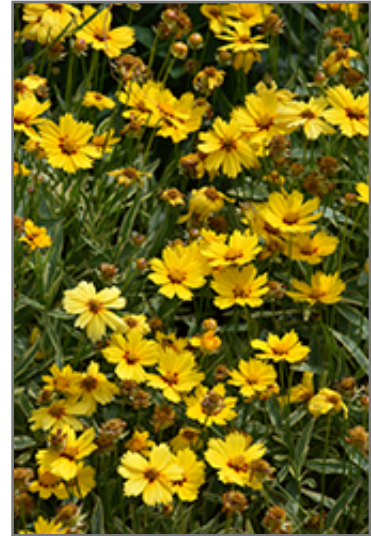
Tequila Sunrise Tickseed flowers