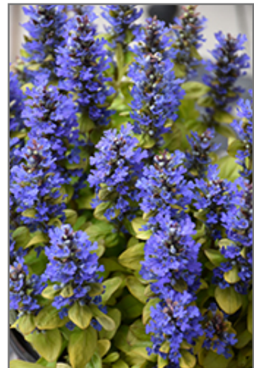
Feathered Friends Petite Parakeet Bugleweed flowers