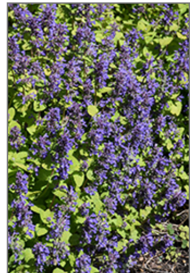
Chartreuse On The Loose Catmint flowers