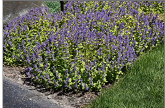
Chartreuse On The Loose Catmint in bloom