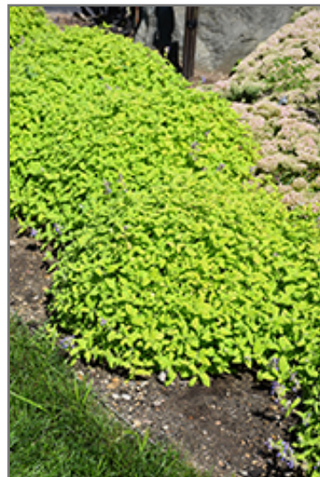
Chartreuse On The Loose Catmint