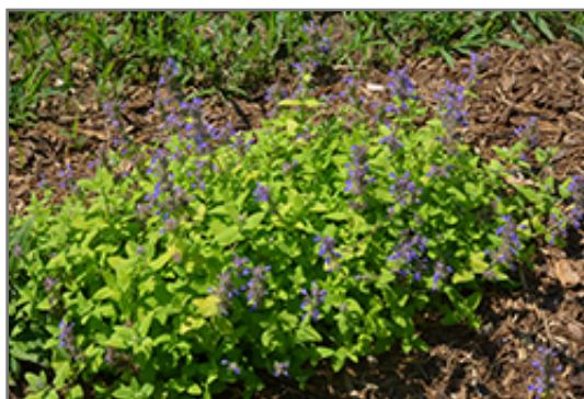
Chartreuse On The Loose Catmint in bloom