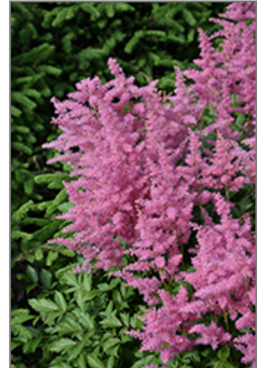
Visions in Pink Chinese Astilbe flowers

Visions in Pink Chinese Astilbe is recommended for the following landscape applications;