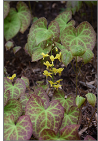
Froehnleiten Bishop's Hat flowers

Froehnleiten Bishop's Hat is a fine choice for the garden, but it is also a good selection for planting in outdoor pots and containers. Because of its spreading habit of growth, it is ideally suited for use as a 'spiller' in the 'spiller-thriller-filler' container combination; plant it near the edges where it can spill gracefully over the pot. Note that when growing plants in outdoor containers and baskets, they may require more frequent waterings than they would in the yard or garden.