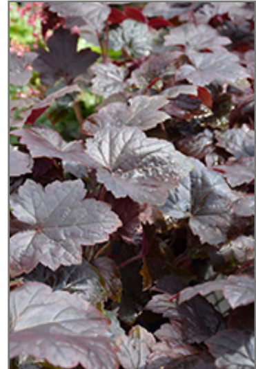
Blackout Coral Bells foliage

Blackout Coral Bells is recommended for the following landscape applications;