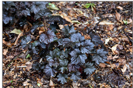
Blackout Coral Bells