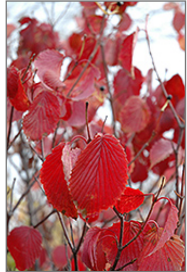
Arrowwood in fall

This shrub does best in full sun to partial shade. It prefers to grow in average to moist conditions, and shouldn't be allowed to dry out. It is not particular as to soil type or pH. It is highly tolerant of urban pollution and will even thrive in inner city environments. This species is native to parts of North America.