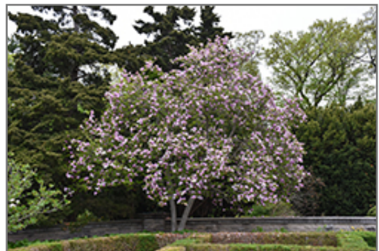
Jane Magnolia in bloom