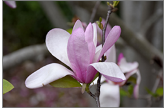
Jane Magnolia flowers

This shrub does best in full sun to partial shade. It requires an evenly moist well-drained soil for optimal growth, but will die in standing water. It is not particular as to soil type, but has a definite preference for acidic soils. It is quite intolerant of urban pollution, therefore inner city or urban streetside plantings are best avoided. Consider applying a thick mulch around the root zone in winter to protect it in exposed locations or colder microclimates. This particular variety is an interspecific hybrid.