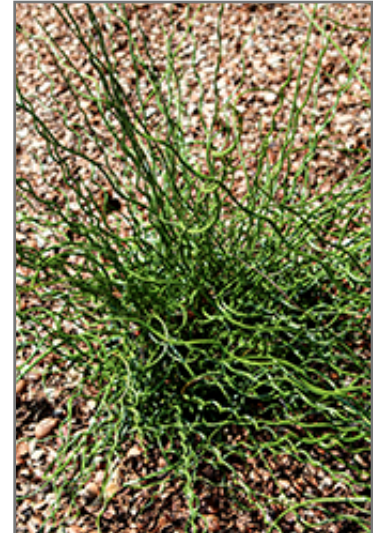
Curly Wurly Corkscrew Rush Photo courtesy of NetPS Plant Finder