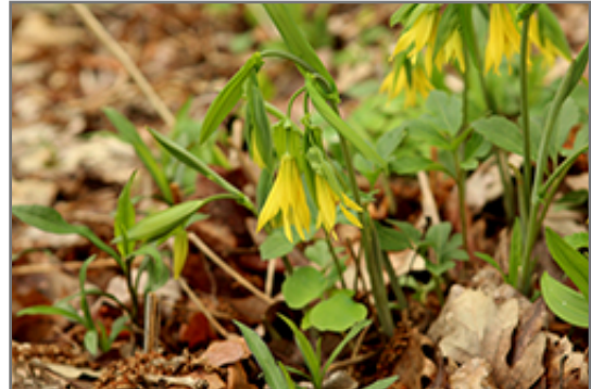
Great Merrybells flowers

Great Merrybells is recommended for the following landscape applications;