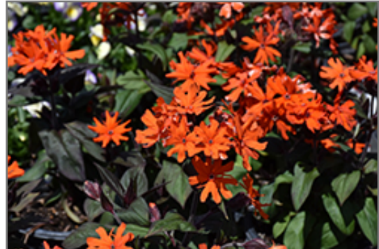
Orange Gnome Champion flowers

Orange Gnome Champion is recommended for the following landscape applications;