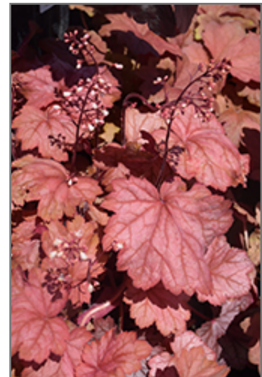
Georgia Peach Coral Bells in bloom