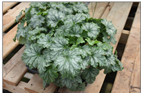
Paris Coral Bells foliage