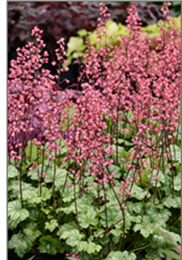
Paris Coral Bells flowers

Paris Coral Bells is recommended for the following landscape applications;