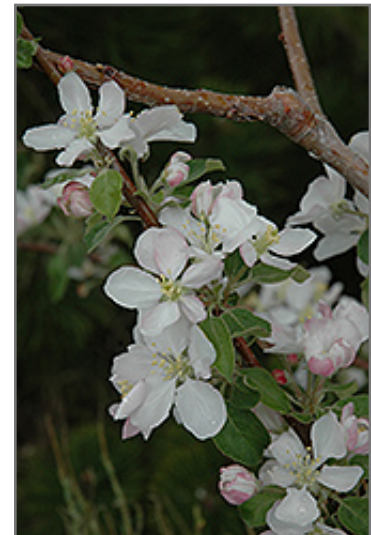
Pink Lady Apple flowers