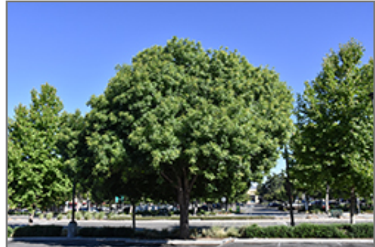
Chinese Pistache